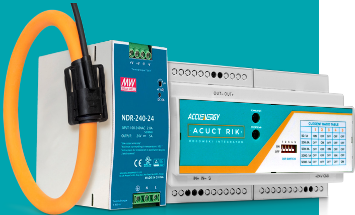
Rogowski Coil and Power supply sold separately

The Accuenergy Relay Class Rogowski Integrator Kit is engineered to be an installer-friendly, plug-and-play solution for use with any protection relay or power meter with a 1A nominal input. Ideal for installations where spacial constraints or conductor size prohibit the use of rigid-body current transformers, flexible Rogowski coils streamline the installation process for exceptionally rapid deployment.